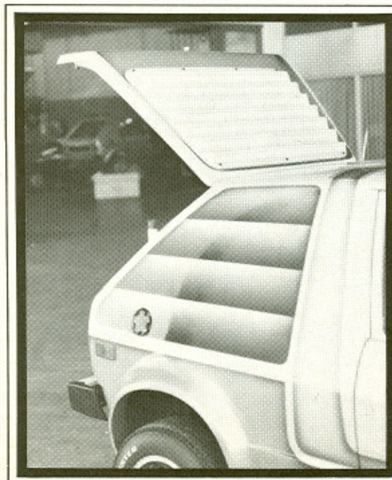
BELOW LEFT, trick paint on the Rabbit gives an appearance of a louvered side window. BELOW RIGHT, interior of the Rabbit features crushed velvet with buttons.

Tynan's didn't leave the engine stock either as a number of internal modifications were performed by Dan Withers, least of which was the addition of a turbocharger. The engine now produces twice the amount of horsepower to the