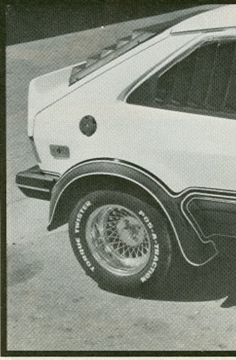
LEFT CENTER, smoked sunroof makes driving the Scirocco a bit more comfortable. RIGHT CENTER, spoiler which is blended into the front fender flares also has vents molded into it. ABOVE, the Scirocco is one bad lookin' dude from the rear. RIGHT, fender flares allow for the use of wide tires and wheels.

rear wheels that it did in stock form, yet all of the emission control equipment is still retained.