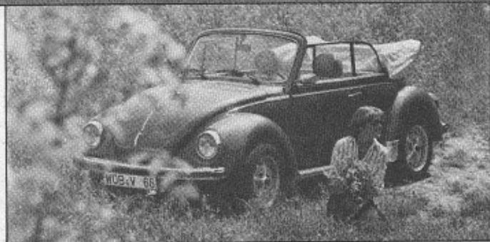
TOP, the '79 Scirocco has no changes externally, but hopefully there will be some surprises under the hood. CENTER, the Polo (left) and the notchback version, called the Derby, are both popular European models that are not sold in this country. ABOVE, the convertible Beetle will be around for another year at least. RIGHT PAGE, the Golf GTI is one of the most popular sporty sedans in Europe, but is unfortunately not available in the U.S.A. The "Rally" Rabbit should look similar.

ful as the present car! It should be a real flier. Powerful American cars such as the Z-28 Camaro, Trans-Am Firebird and Corvette are only available with automatic transmission in California due to the emission requirements, so perhaps VW have run into the same problem with the Turbo Scirocco. Experts in turbo powered cars also claim turbocharged cars with automatic transmission are easier to drive than those with manual transmission.