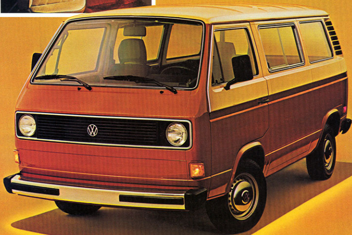
New Vanagon® "L" Assuan Brown with Samos Beige top, one of six standard two-tone exteriors. Topaz cloth interior.