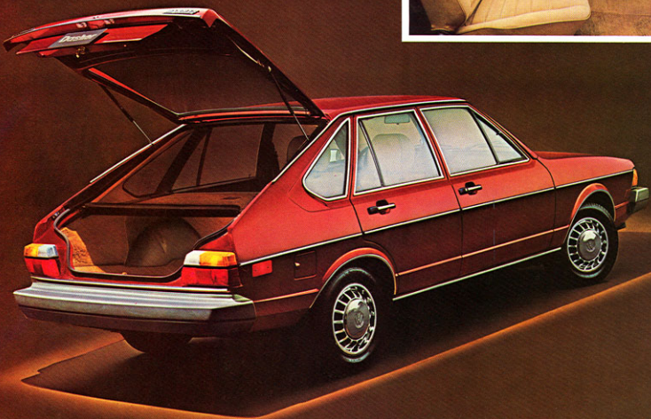
VW Dasher, four-door hatchback, Canyon Metallic. Large trunk expands to 29.3 cubic feet, with rear seat folded. Dasher interior, Gazelle crushed velour.