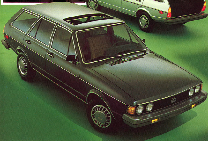
Background: Dasher Wagon, Diamond Silver Metallic. Foreground: Onyx Metallic, sliding sunroof, optional, all models. Elegant wood-grained instrument panel, standard on all Dashers.