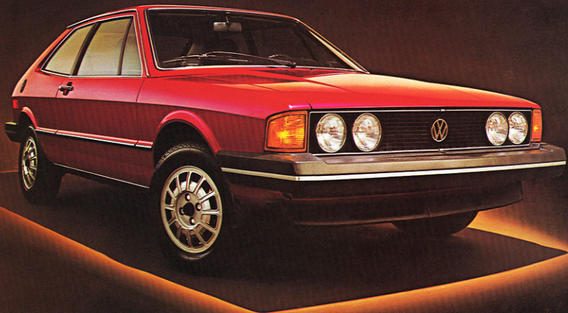
Scirocco, Indiana Red Metallic. Powerful 1.7L fuel-injected overhead camshaft engine is standard. Scirocco interior, Red Leatherette. Both front seats have individual height adjustment, standard.