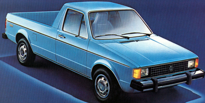
VW Pickup Truck "LX", Lago Blue. Cargo bed is 72" long. Removable tailgate, standard. VW Pickup Truck interior, Midnight Blue leatherette. Available in ten exterior colors, four interior trims, leatherette or cloth.