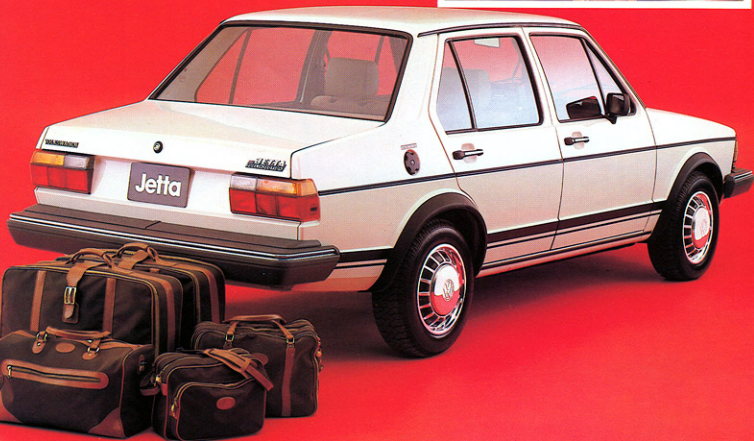
Jetta 4-door, Alpine White with Gazelle interior. Its 22.3 cu. ft. trunk is large enough for 5 good-size pieces of luggage.