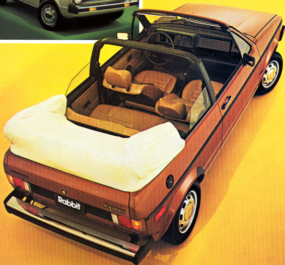
Rabbit 4-seater Convertible, Brazil Brown Metallic. Interior, Gazelle, Top, Sand.