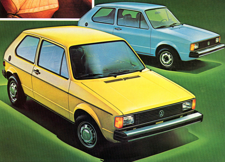
Background: Rabbit hatchback, Lago Blue. Foreground: Rabbit "L" 2-door hatchback, Sunbrite Yellow. Rabbit interior in Autumn Tan with cloth seats.